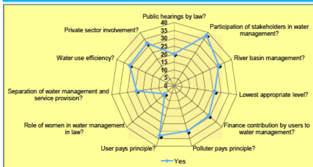
Figure 3 An illustration of the inclusion of IWRM principles in respondents' water laws

The scale shows the number of water laws where the item has been included.